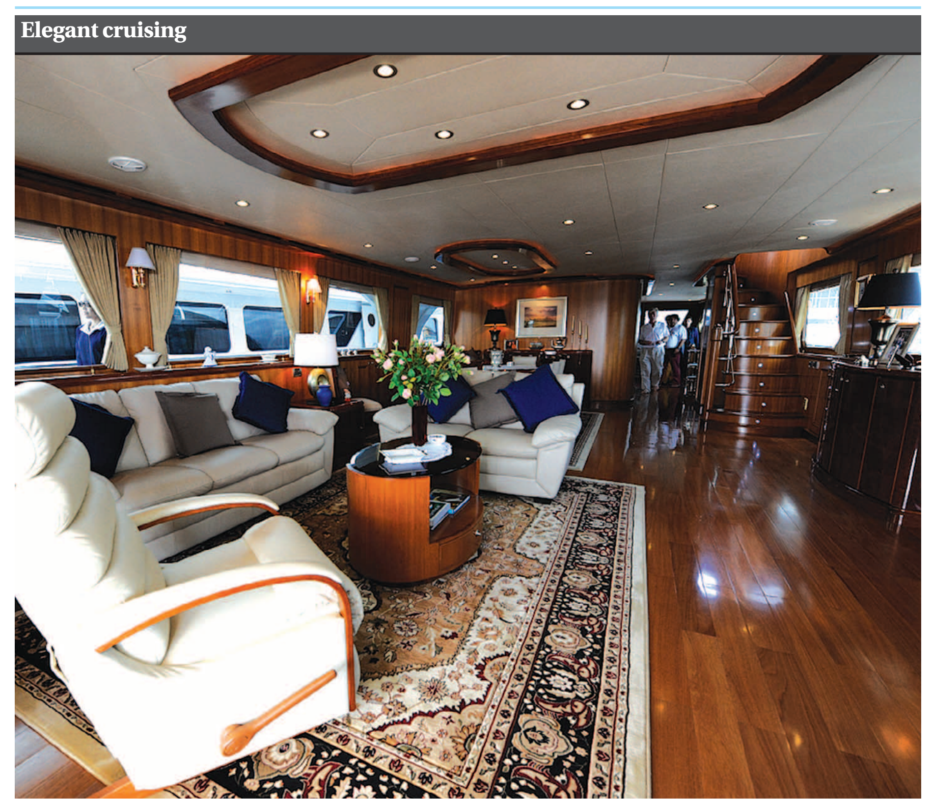
The interior of the elegant $8-million luxury yacht Zarina, which flies the Maltese flag. The yacht is presently on display at the Genoa boat show and is expected in Grand Harbour on Wednesday. >>> Story on pages 30,31